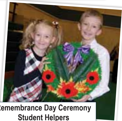
Remembrance Day Ceremony Student Helpers Weledeh Catholic School

STRONG MIND STRONG NORTH Inspired Teaching Changes Lives