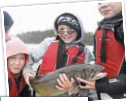
Fish Camp École St. Joseph School