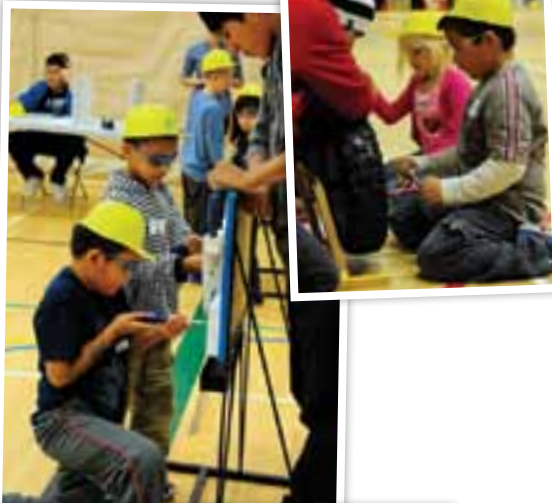
Trade Day for Young Students Kimberlite Career and Technical Centre